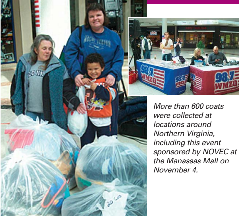
More than 600 coats were collected at locations around Northern Virginia, including this event sponsored by NOVEC at the Manassas Mall on November 4.