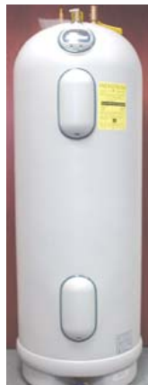
Marathon for super efficiency & lifetime durability

A.O. Smith: An economic water heater with prices beginning at $566 for a 50-gallon tank with basic installation.* ( The A.O. Smith must be purchased with installation. )