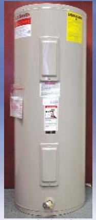
A.O. Smith for economy & value