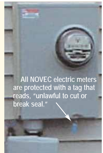
All NOVEC electric meters are protected with a tag that reads, "unlawful to cut or break seal."

NOVEC meter readers typically suspect that current diversion is taking place when they find a broken meter tag or other signs of tampering. Often, current diversion takes place after service has been disconnected for non-payment. For this reason, it is NOVEC's policy to periodically check disconnected meters if the customer has not contacted us to reconnect service. If you suspect that current diversion is taking place in your neighborhood, call (888) 335-0500 or (703) 335-0500 and ask for the collections department.