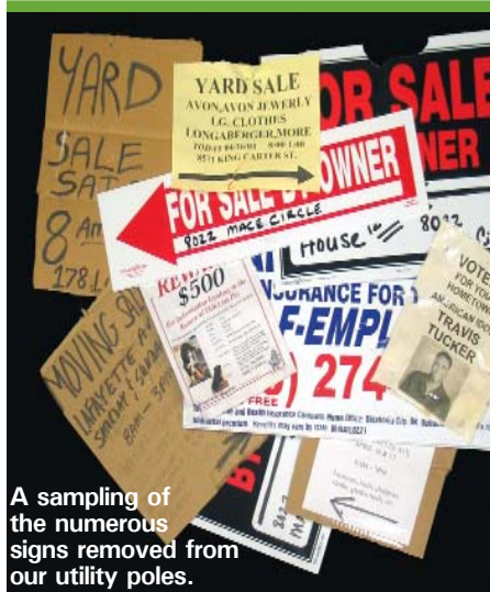
A sampling of the numerous signs removed from our utility poles.