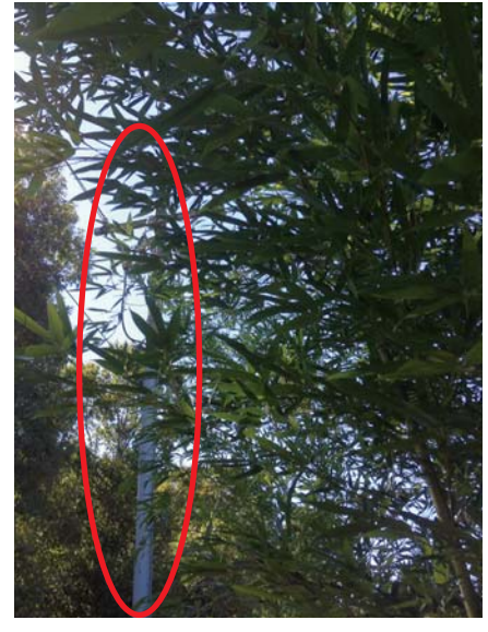
Overgrown bamboo that conceals a power line creates a potentially dangerous situation.

In NOVEC's territory, a few invasive species